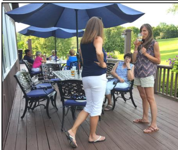
Enjoying the new deck furniture and newly painted deck during the clambake!